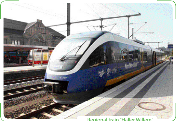
Regional train "Haller Willem"